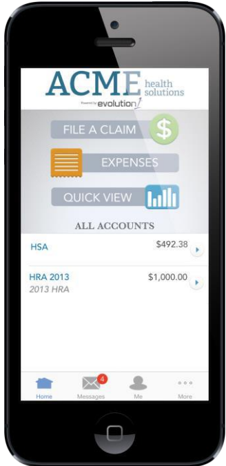
Above: With the convenience of a mobile device, you can see your available balance anywhere, anytime as well as file claims and upload receipts.

*The amount you save in taxes with a Flexible Spending Account will vary depending on the amount you set aside in the account; your annual earnings; whether or not you pay Social Security taxes; the number of exemptions and deductions you claim on your tax return; your tax bracket and your state and local tax regulations. Check with your tax advisor for information on how participation will affect your tax savings.